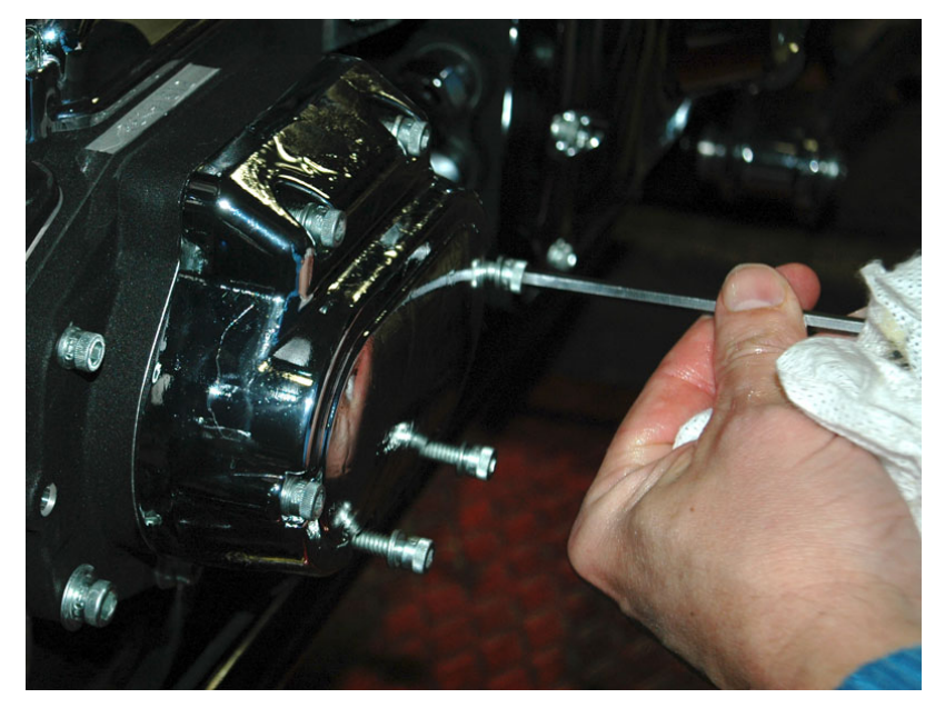
Turn all six srews into the cases but dont tighten them (cover should be left loose)!