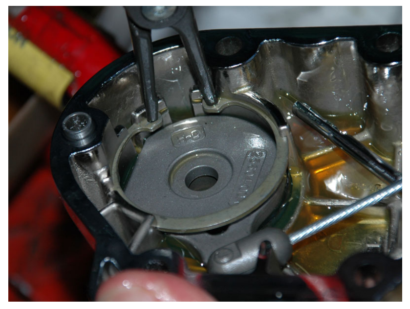
Remember the exact position of the retaining clip before you start to remove this clip (later it has to be fitted at the same position to the gap in the cover).