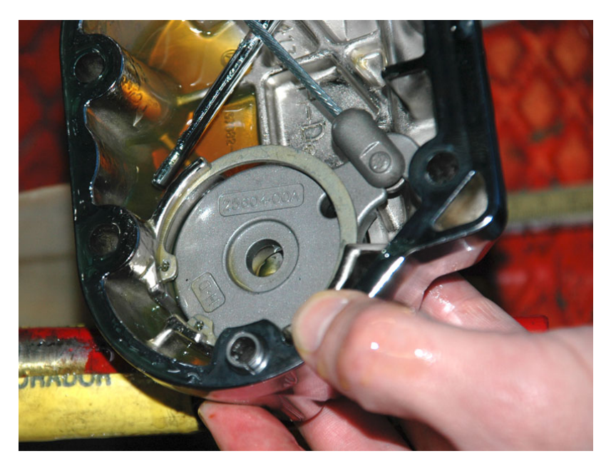
Look at the inside of the removed cover and see the OEMclutch drive unit. The inner plate will be exchanged with the Clutchlite.