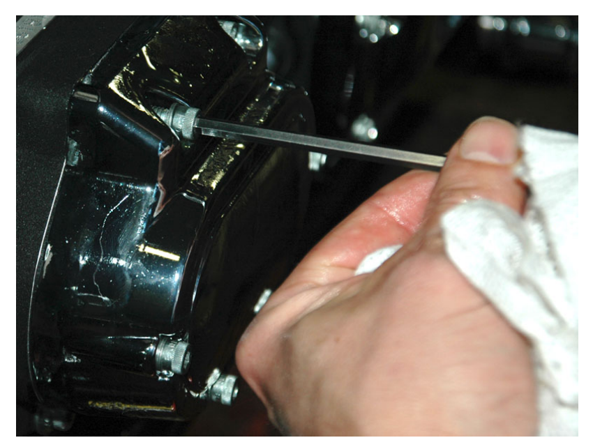
Tighten all six screws now crosswise and refill transmission oil to the correct level.

Adjust clutch working area to the Harley-Davidson® factory specifications at the clutch cable adjusment screw in front of the engine.