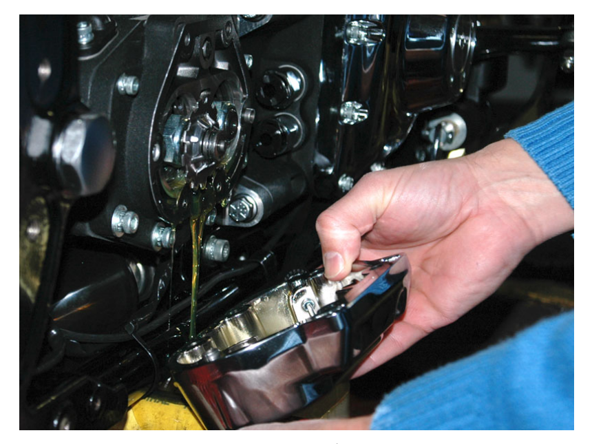
Now remove the cover with care (oil will exit the transmission case!).