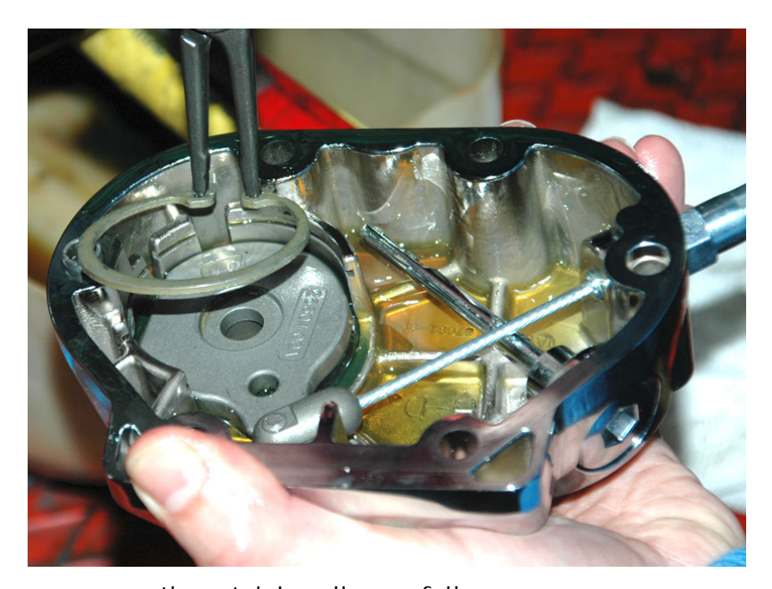
... remove the retaining clip carefully.