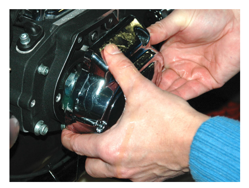
Fit clutchcable and then the cover on the transmission case but watch the two center bolts and the gasket fit.