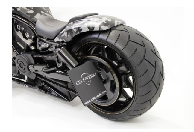
Abb. 1 – HD-ROD061 with side number plate holder & light system

For the installation of the rear it is necessary to dismantle the original rear incl. licence plate holder and light system. A side licence plate holder (e.g. HD-ROD012) and a lighting system that complies with the law (e.g. HD-UNI005 incl. holder HD-ROD050) must be fitted.