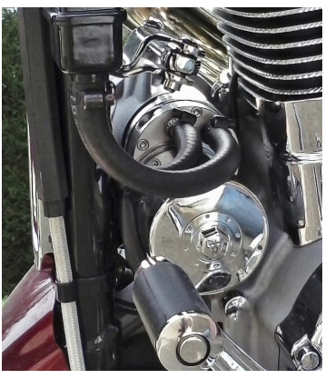
This mounting orientation may be required on some Sportster models

Some Sportster models may require rotating the mounting of the 4700 offset oil filter adapter 180 degrees, placing the hoses above the filter (see photo at right). In these installations, the anti-rotation device is not required, and you may now skip to step 16.